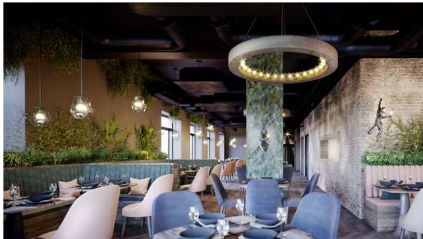
The Village Centre Restaurant

Construction for the Village Centre South began in July 2018 and it is anticipated that the offerings will be open by the end of 2020. More details on the brands and offerings coming soon.