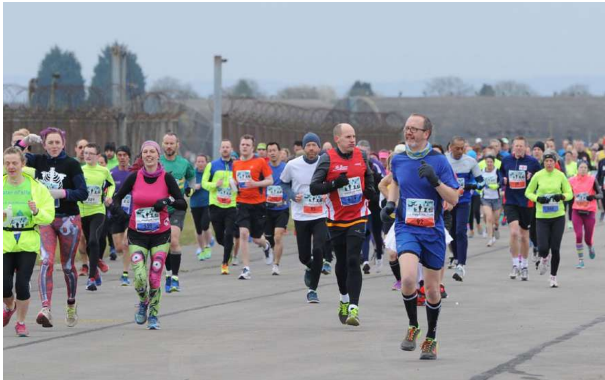
Image from Race at the Base